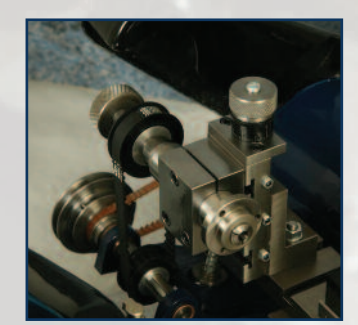
Mill Head & Vertical Slide

A range of five 150mm (6.00") diameter headstock division plates (G1-G5 see accessory page for Wheel&Pinion Cutter) is available. One division plate of the customer's choice is supplied with the unit. The division plate mounts upon an adapter that attaches to the rear of the 90CW lathe's headstock spindle. A sturdy detent mechanism with a spring-loaded detent pin ensures a positive location in the division plate to eliminate headstock spindle movement.